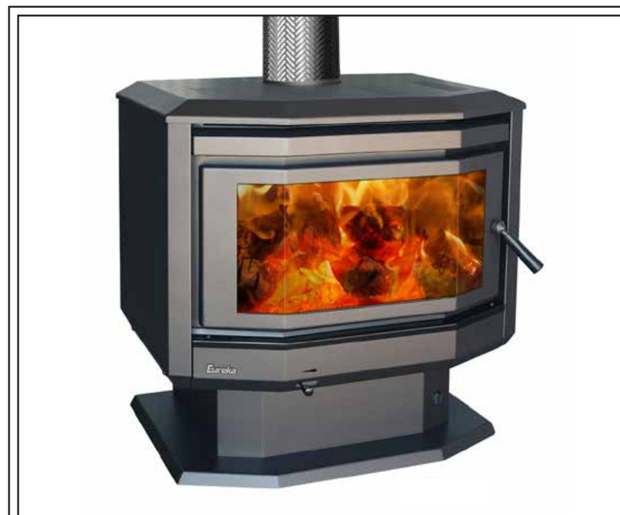
Solitaire SRS3 Freestanding