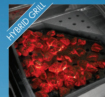
67731 – Charcoal Smoker Tray