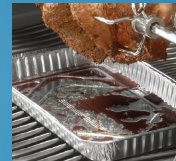
62008 – Large Drip Pans