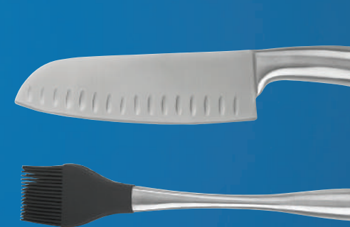
70012 – Professional 5 pce Tool Set