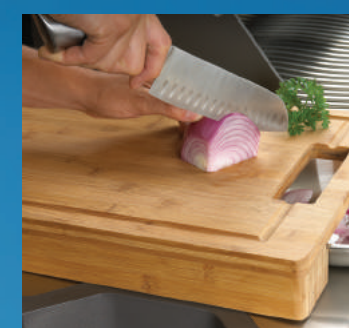
70012 – Professional Cutting Board