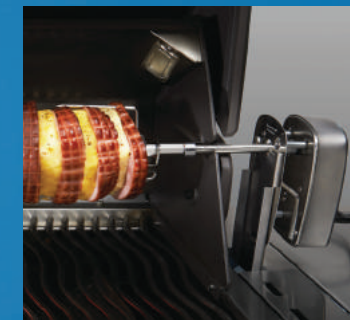
69334 – Professional Rotisserie Kit