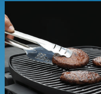
55019 – Stainless Steel Spatutong