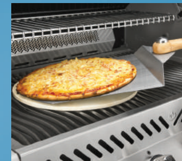
70003 – Pizza Spatula