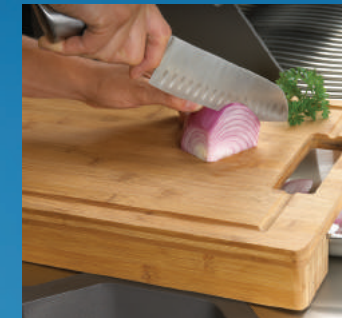
70012 – Professional Cutting Board