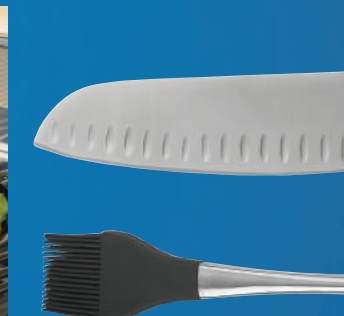
70012 – Professional 5 pce Tool Set