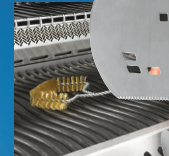
62011 – Brass Grill Brush