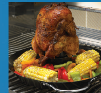
69334 – Professional Rotisserie Kit