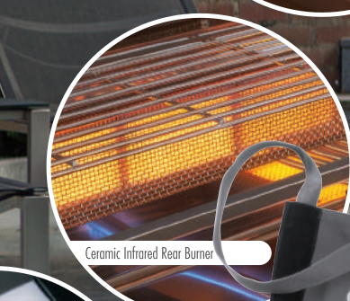
Ceramic Infrared Rear Burner