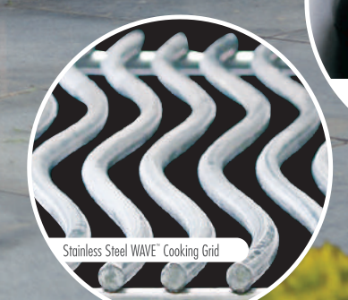
Stainless Steel WAVE™ Cooking Grid