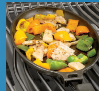
56003 – Cast Iron Skillet