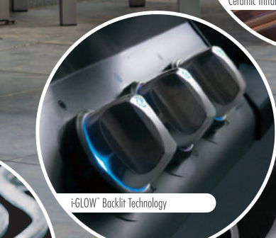
i-GLOW™ Backlit Technology