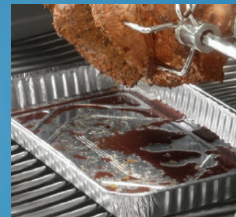
62008 – Large Drip Pans