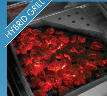
67731 – Charcoal Smoker Tray