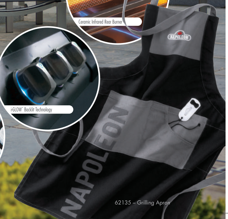
62135 - Grilling Apron