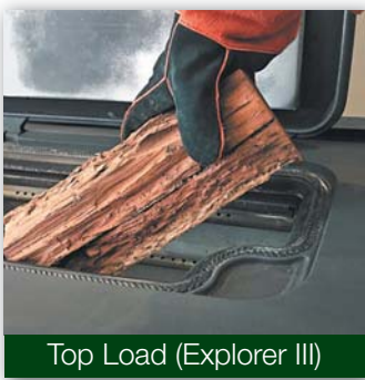
Top Load (Explorer III)

Feature packed slow combustion stove in a convenient design