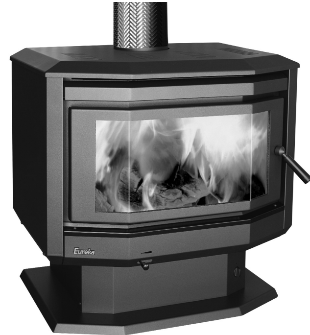
Solitaire SRS2 Freestanding shown

Solitaire SRS2, Onyx, Diamond & Emerald Mk3 Freestanding